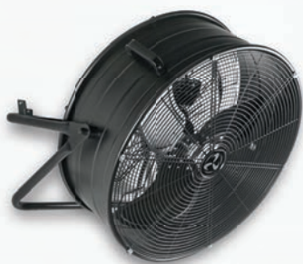
Wall mounting accessory WHDF # 96080 please order separately