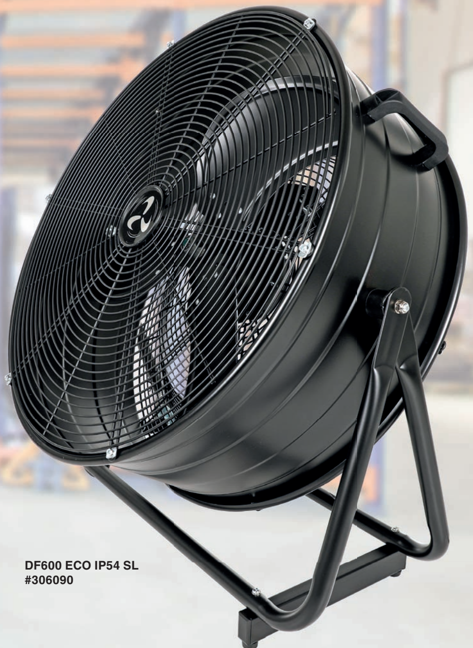
DF600 ECO IP54 SL #306090