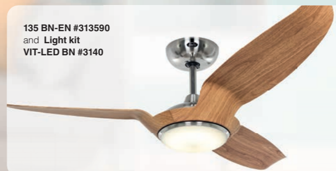
135 BN-EN #313590 and Light kit VIT-LED BN #3140