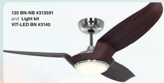
135 BN-NB #313591 and Light kit VIT-LED BN #3140