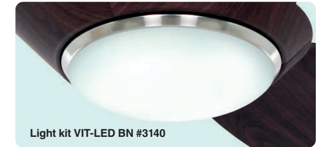
Light kit VIT-LED BN #3140