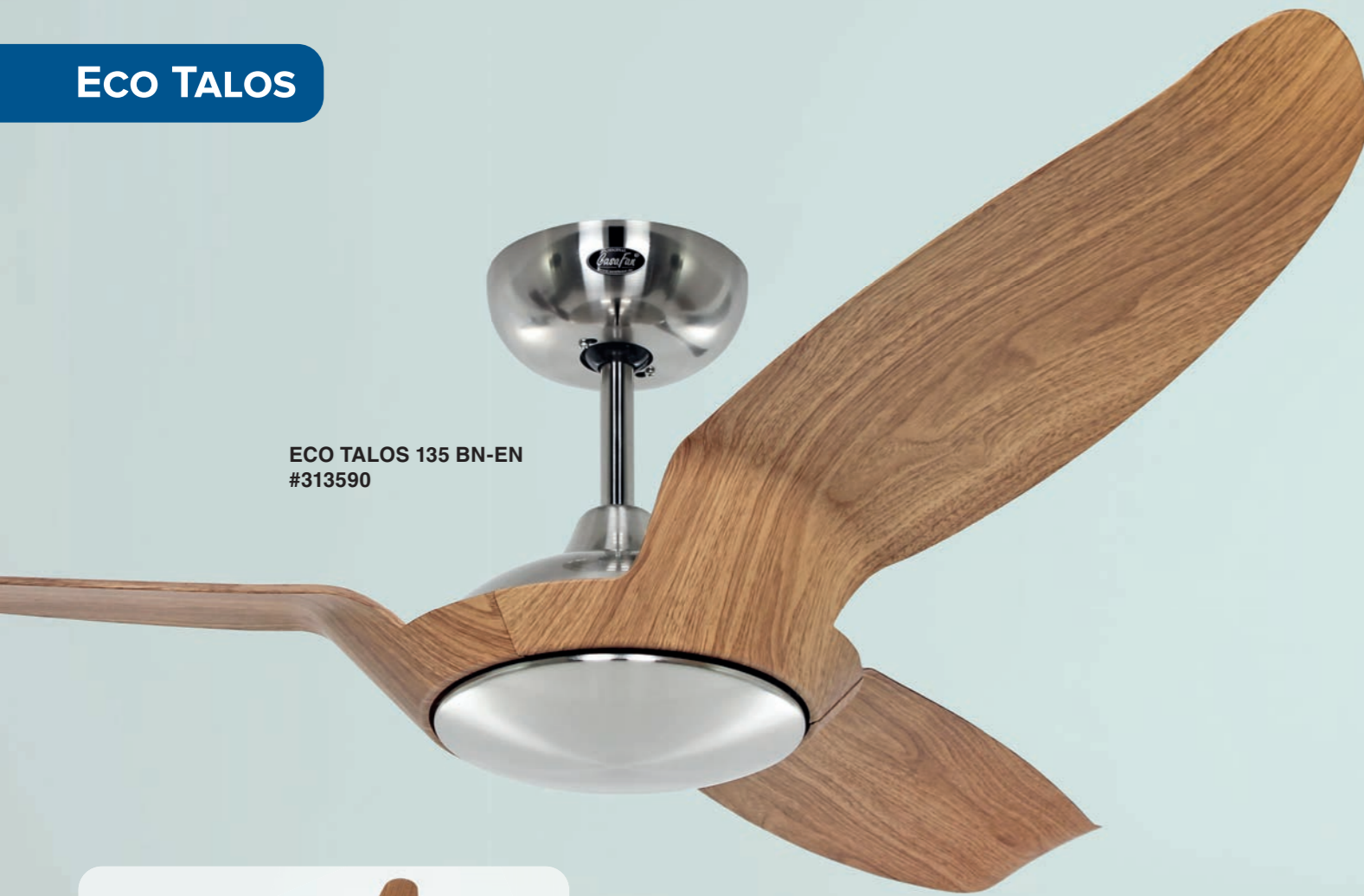
ECO TALOS 135 BN-EN #313590