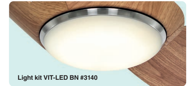
Light kit VIT-LED BN #3140