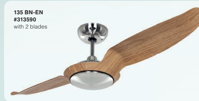
135 BN-EN #313590 with 2 blades