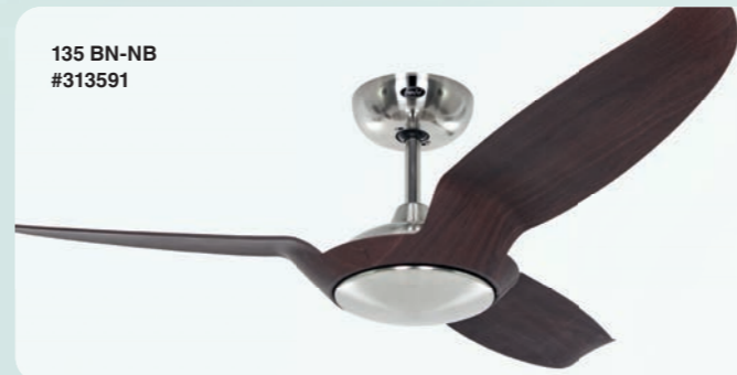
135 BN-NB #313591