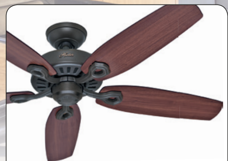
BUILDER ELITE NB #50567 housing new bronze, reversible blades brasilian Cherry (see picture)/yellow walnut