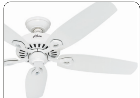
BUILDER ELITE WE #50565 housing white, 5 blades white finish